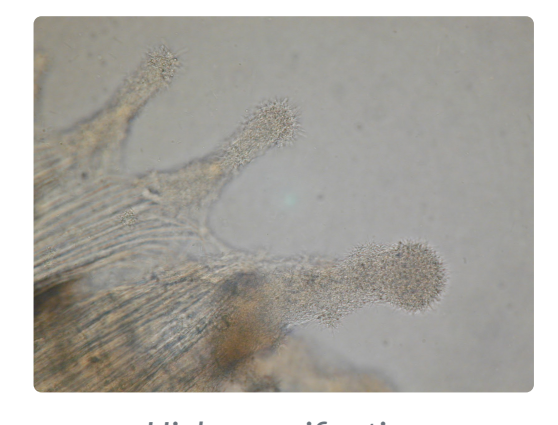
High magnification photomicrograph of a fin biopsy showing a clump of Flavobacterium columnare bacteria – note the commonly seen "haystack" formations on the edges of fin rays