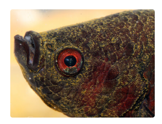
Velvet disease in a fish

■ Etiology: Amyloodinium ocellatum is a parasitic dinoflagellate that attaches to, and invades, the skin of brackish to marine fish (salinity of 3–45 ppt)