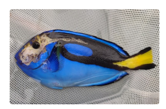
Head and lateral line erosion in a Pacific blue tang