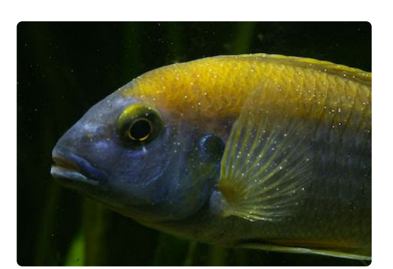
Ich in a freshwater fish; note the white spots all over the surface